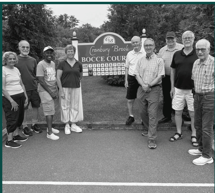
Members of the Plainsboro and Cranbury Brook bocce team(s) are pictured at the Cranbury Brook bocce court

This year, Plainsboro Park bocce enthusiasts have extended bocce challenges to teams at neighboring bocce courts. The first challenge game was held between the Plainsboro Park bocce team and the Cranbury Brook bocce players at the Cranbury Brook courts in August. With home court advantage, the Cranbury Brook players took a two-game win. A return challenge took place on September 3rd at the Plainsboro bocce court and with home court advantage now on Plainsboro's side, Plainsboro bested their opponents in two games. Yet another match-up was held in mid-September at Cranbury Brook. Clearly the teams are enjoying the challenge and the conviviality of the games!